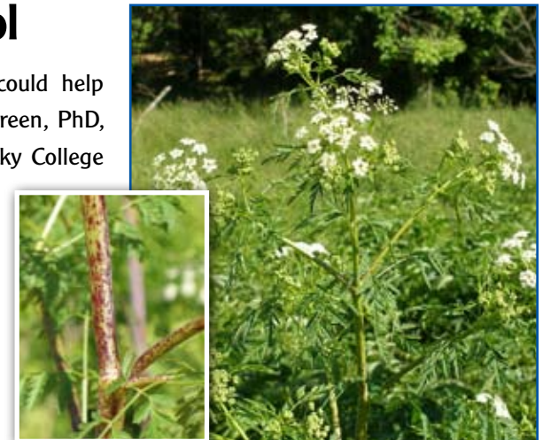
Mature poison hemlock and its distinctive spotted stem (inset)

Poison hemlock can be toxic if ingested by livestock or humans. Cattle, goats, and horses are considered to be the most susceptible animals but others can also be affected. If ingested, clinical signs of poisoning appear within 30 minutes to two hours, depending on factors such as animal species and quantity consumed. These signs include nervousness, trembling, muscle weakness, loss of coordination, pupil dilation, coma, and eventually death from respiratory failure. If ingested by a pregnant animal it can cause fetal deformities.