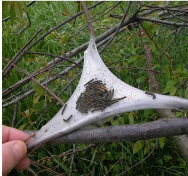
ETC tent with massed caterpillars