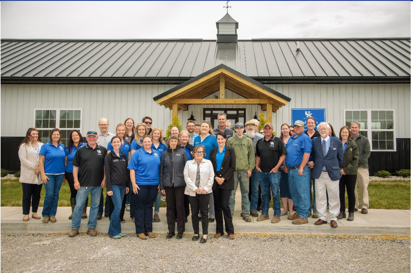
THE LINDA MARS AGED HORSE CARE AND EDUCATION FACILITY WILL HELP LEAD BREAKTHROUGHS IN CARE FOR OLDER HORSES.