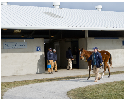
Photos: Maine Chance Farm participates in the Fasig-Tipton sales