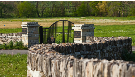
Public entrance to Maine Chance Equine Campus