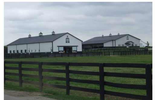
Part of the Maine Chance Equine Campus facilities