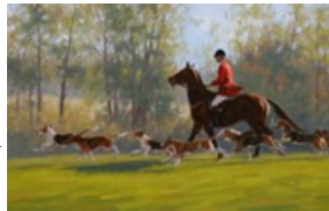
Beth Parcell Evans Spirited Departure, 2011 Oil, 28 x 38”

This exhibition includes 70 paintings, sculptures, watercolors and drawings from all over the United States and tells a story about the animal kingdom. Visitors will also have the chance to see a bronze sculpture of a weary lioness, a pastel of a blue jay and an oil painting portraying a wet kiss between two otters. In addition, 10 works of art featuring horses have been added exclusively for the exhibit’s stop in the Bluegrass.