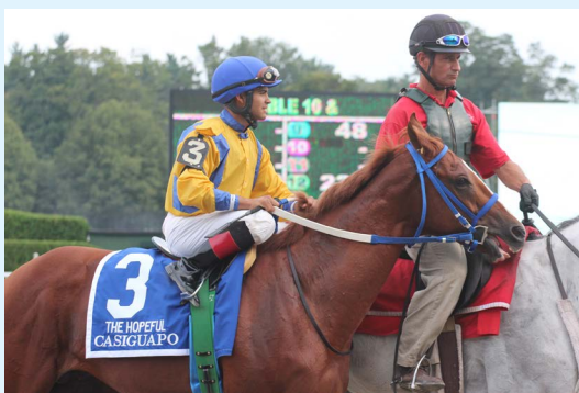
Casiguapo racing at Saratoga