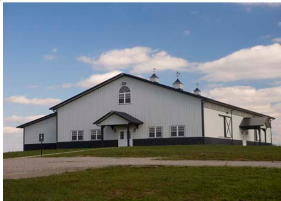
Teaching Pavillion at Maine Chance

With the creation of the Equine Initiative in 2005, plans were made to update and construct new facilities on the Maine Chance campus. Since then, a 10,000 square foot teaching pavilion has been constructed for active demonstrations and a nearby existing barn has been renovated inside and out to become a foaling barn and teaching facility. In addition, several buildings have been updated or constructed on the Spindletop Farm side of North Farm. There are future plans to build a learning center with classrooms and laboratories, two new research barns and a livestock exhibition center.