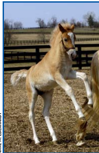
FLD/CFS might be heritable.

The cause of FLD/CFS in horses is unknown. Muscle, tendon, and ligament tissues appear normal when examined microscopically by pathologists. Theories as to the cause include uterine insufficiency, exposure to toxins during embryonic development, dietary issues, and viral infections of the mare during pregnancy. However, recent family studies suggest the condition could be inherited. Some mares have produced up to four affected foals even when each foal is sired by a different stallion and the mare has been housed on different farms. This rules out a management component to the disorder. Individual cases suggest the condition might be inherited in a dominant fashion, but might not always develop depending on other genetic