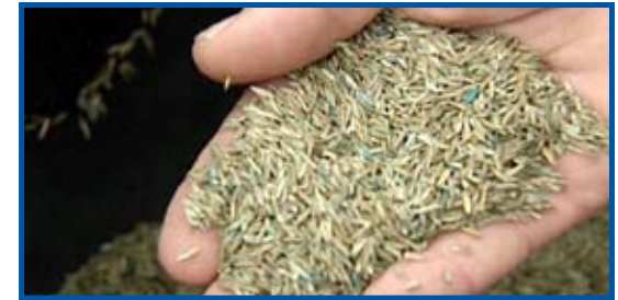
Quality and amount of seed used is key.

7. Allow time for seedlings to establish. Returning horses to an overseeded pasture too soon can wipe out any seedlings by grazing or trampling. Ideally, a pasture should have one year of rest after overseeding before heavy grazing resumes; however, seedlings can generally tolerate a few sessions of light grazing. Harvesting the pasture once