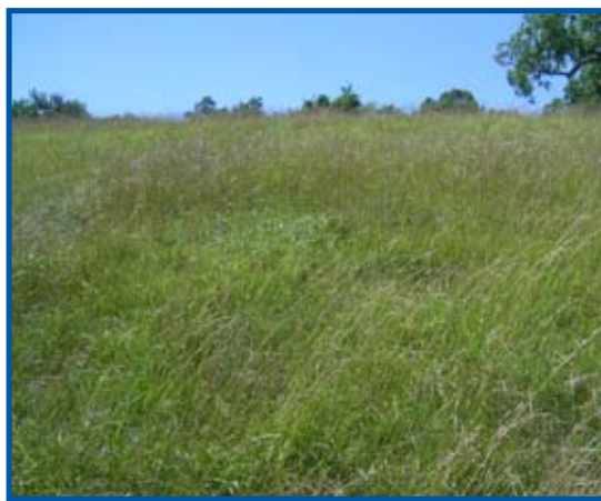
Overseeding entails planting seed in a field to fill in bare patches and thicken the stand.

2. Use high-quality seed of an improved variety. Use a variety that is a proven top performer under Kentucky conditions. The UK forage testing program tests the survival of cool-season grasses under grazing by horses and reports these findings in Forage Variety Trials, ( www.uky.edu/Ag/Forage ). High-quality seed has high germination rates and is free