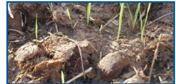
An overseeded pasture needs a year of rest.

for hay after the grass has reached maturity before returning the pasture to full grazing is also recommended. If it is not possible to limit grazing for a full year, consider using temporary fencing and overseeding half of a pasture one year, then the other half the following year.