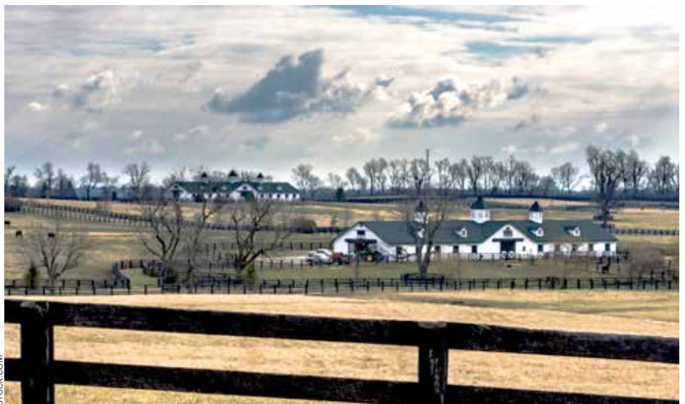
The equine industry had another steady year and accounted for 17% of Kentucky's sales receipts in 2016.

Poultry receipts should be back on track in 2016 after rebounding from the effects of avian influenza in 2015, with growth