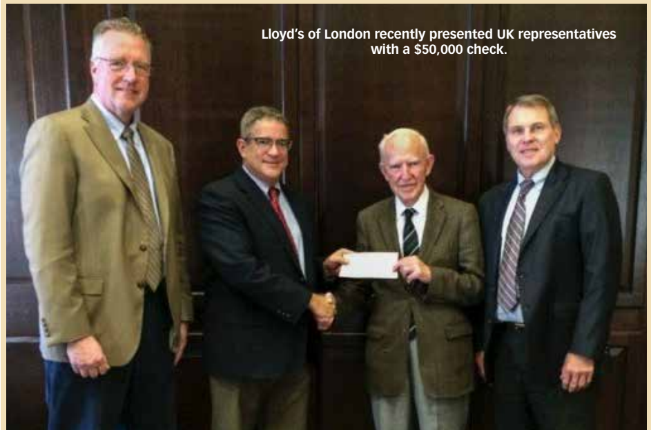
Lloyd's of London recently presented UK representatives with a $50,000 check.