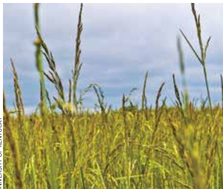
Tall fescue grows well, but some varieties can contain a toxic fungus.

The Tall Fescue Renovation Workshop will take place March 9, 2017, at UK's Veterinary Diagnostic Laboratory and UK's Spindletop Research Farm.