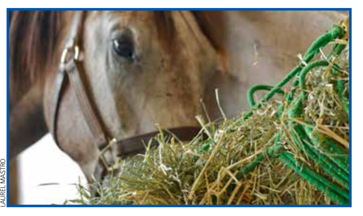
Soaking hay can reduce respirable dust and mold levels.

vesting processes can result in excess dust and/or mold in hay that can cause problems in horses. For example, dust can accumulate in hay grown near dusty roads, and mold can form in hay that has been baled in wet conditions. Dust particles can cause