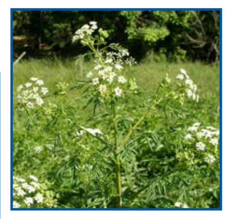
Clockwise, from top left: deadnettle, poison hemlock, and henbit are three pasture weeds horse owners can expect to see return to their fields this year.

Any discussion about weed emergence must begin with an understanding of these pasture plants we call "weeds." Whether native or nonnative, these plants grow only where they are supposed to grow—in an ecological niche that allows them to germinate, emerge, grow, and reproduce before a human activity prevents seed