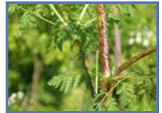
Mature poison hemlock (top) and the plant's characteristic purple mottled stem.

This plant is extremely poisonous to horses and humans. All plant parts contain the poisonous alkaloids; however, the fruits contain the greatest concentration of the alkaloids. Poison hemlock gives off a bad odor when crushed, and horses rarely eat this plant because of its low palatability. Poison hemlock plants harvested with hay maintain the toxic properties; care should be taken to avoid feeding hay containing this plant.