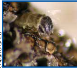
UNIVERSITY OF KENTUCKY

all at once," he continued. "This is an important survival mechanism that protects the species from high mortality. Prolonged egg hatch increases the chances of species survival, even if some early caterpillars are killed by freezes or heavy rains during early spring."