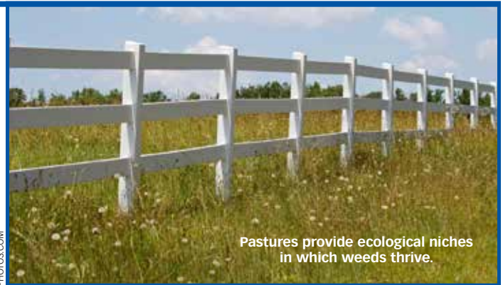
Pastures provide ecological niches in which weeds thrive.

Kentucky is located in the temperate transition zone, which allows warm-season or cool-season plants to grow. Warm-season weeds germinate in spring or early summer, grow, and produce seeds before frost. Cool-season weeds germinate and produce some growth in the fall and produce seeds the following spring or summer. The numerous weed species provides