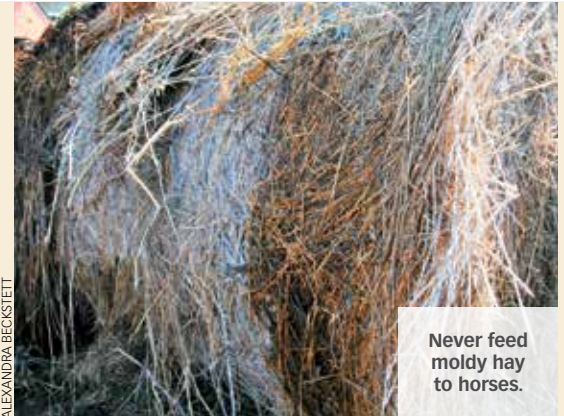
Never feed moldy hay to horses.