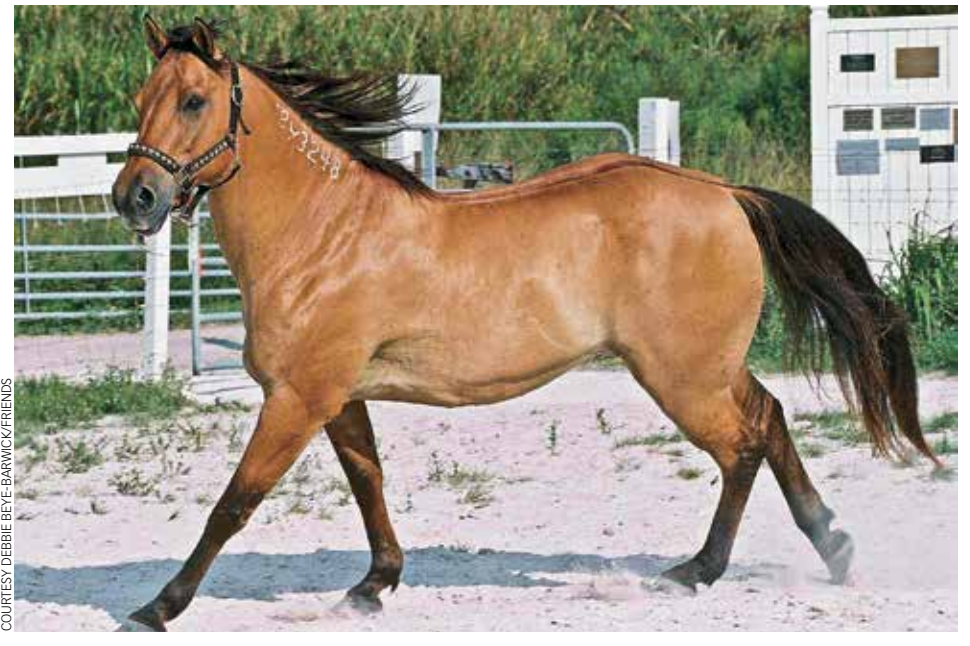
Infected horses, like this one at FRIENDS Horse Rescue & Sanctuary, often show no outward signs of disease, but they must be branded as EIA-positive and quarantined for life if not euthanized.

EIAV attacks the horse's immune system. Clinical signs include muscle weakness, progressive loss of condition, and poor stamina. An affected horse might also develop a fever, depression, and anemia.