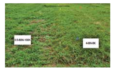
The plot on the left was clipped close, but fertilized heavily with nitrogen and potassium. The one on the right was clipped high, but not fertilized. No amount of fertilizer will compensate for poorly managed pastures.

stick to the leaf surface and cause damage.