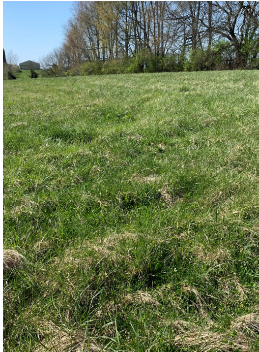
FIGURE 1, BECAUSE THIS PASTURE HAS BEEN GIVEN SUFFICIENT REST IN RECENT YEARS, IT HAS THICK GROWTH AND A HEALTHY GREEN COLOR. OVERSEEDING THIS PASTURE WOULD BE A WASTE OF TIME AND SEED.

There is no need to overseed dense grass pastures. Seedlings need sunlight to germinate and grow, so if you can't see many large spaces (at least 6 inches) of open ground, seeding is not worthwhile. So carefully consider if overseeding is necessary, because fall is typically a better time of the year. (Figure 1) • Legumes – Legumes can really tell you a story. Red clover typically indicates better than average management, particularly if you see a fair bit of it, because it doesn't survive well under heavy horse grazing. Sprinkles of white clover throughout a pasture are ideal, but large patches of pure white clover are signs of overgrazing in the past, and likely locations of weeds or bare soil