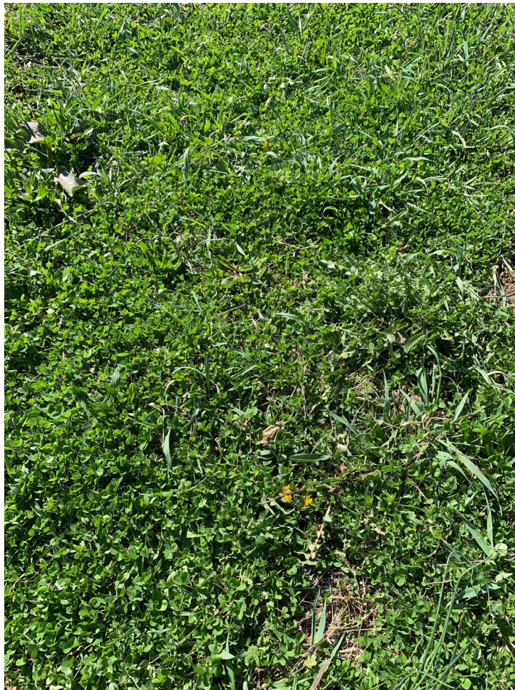
FIGURE 2, THICK STANDS OF WHITE CLOVER ARE A CLEAR INDICATION OF OVERGRAZING, AND LIKELY THE LOCATION OF SIGNIFICANT WEED ESTABLISHMENT IN THE NEAR FUTURE.

depends on the weed species, so determine the best timing for the specific weeds in your pastures. Weeds present will vary from one pasture to the next, so consider each pasture separately. For a list of more common weeds in Kentucky, as well as the best herbicides and time frames for control, check out Broadleaf Weeds of Kentucky Pastures -AGR 207 by Dr. J.D Green . Always read and follow all herbicide label recommendations.