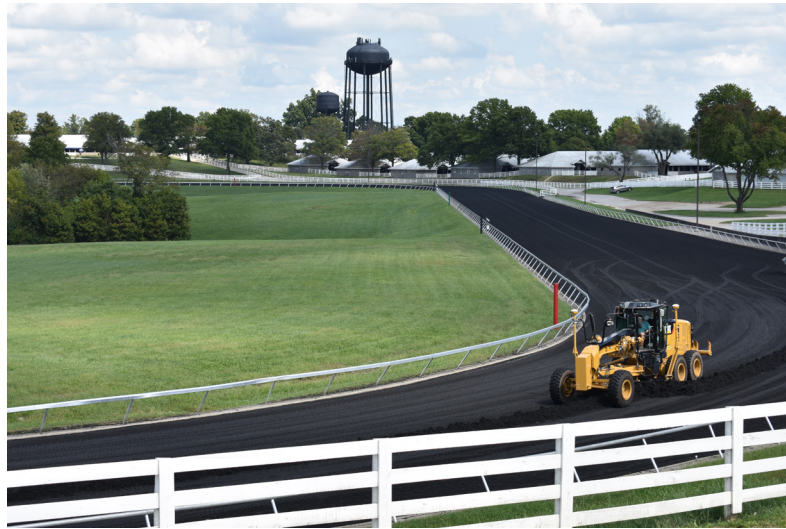
TO VIEW THE VIDEO, CLICK HERE.

ing horses and riders safe during a race. Grading school participants received one-on-one instruction operating a new grader and an older one. They also learned how to properly grade synthetic and dirt racetracks. All hands-on instruction was at Keeneland.