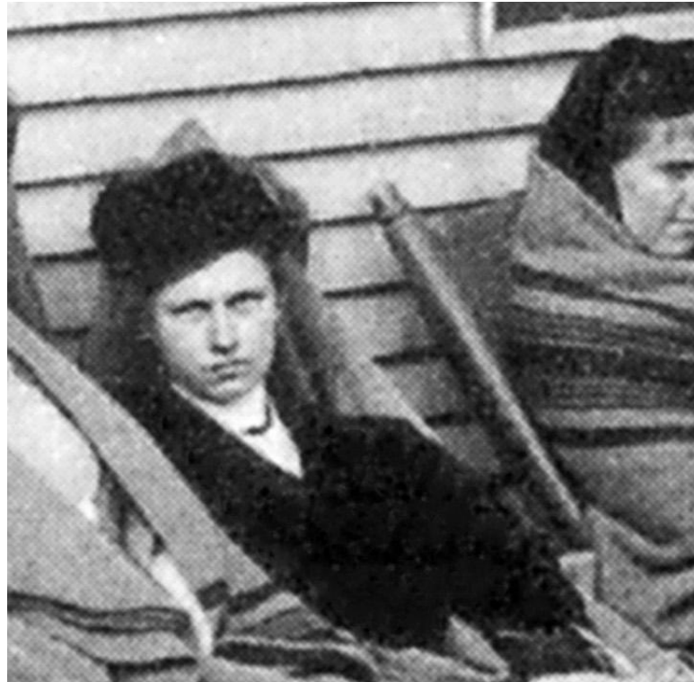
MARY MALLON, BETTER KNOWN AS TYPHOID MARY, LEFT, SITS AMONG A GROUP OF INMATES QUARANTINED ON AN ISOLATED ISLAND ON THE LONG ISLAND SOUND.

In times where we can barely even imagine how few research tools these scientists had at their disposal, the need for rigor was paramount. Medical science was emerging from an era of empirical practices which included treatments with multiple, often spurious, ingredients and archaic practices with little evidence of